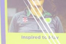
Inspired to Play