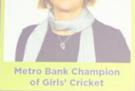
Metro Bank Champion of Girls' Cricket