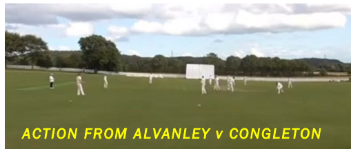
ACTION FROM ALVANLEY v CONGLETON

WK 14 - JULY 22 No play in any 1st Division fixtures sadly. Matches cancelled: Bowdon v Timperley; Congleton v Macclesfield; Lindow v Bramhall; Oulton Park v Alvanley; Sale v Urmston; Stockport Georgians v Romiley.