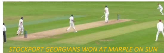
STOCKPORT GEORGIANS WON AT MARPLE ON SUN