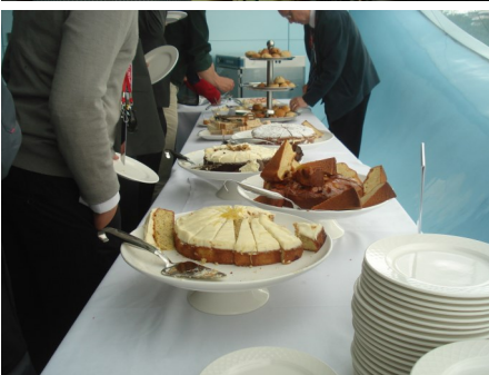
Teatime in the media centre (table 1 of 3!)

Here's the scene pre-toss. How many people?! And, please note, no umpires were allowed anywhere near!